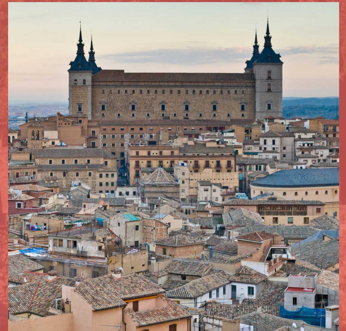
Alcázar of Toledo