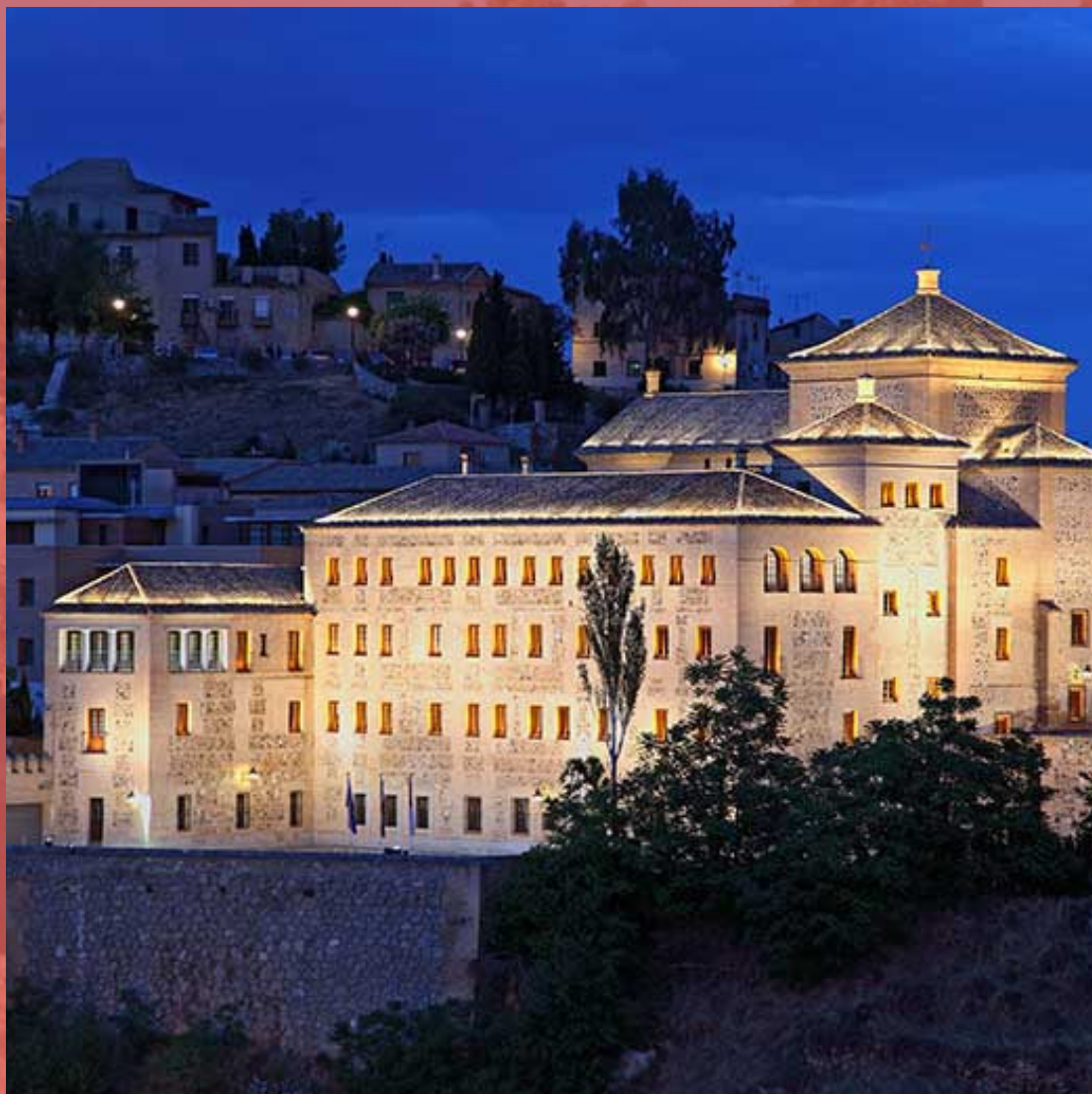
Castilla-La Mancha Parliament